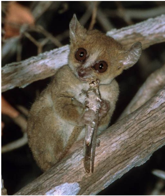
Figure 1. Grey mouse lemur.

cam, fluid therapy, and vitamins and supplementary food as supportive care. Two days after initial presentation, the lemur was found dead.